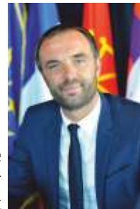
Michaël Delafosse Montpellier's mayor Montpellier Méditerranée Métropole's president

Counting on your cooperation to respect the safety instructions, we wish you a pleasant stroll in one of Montpellier's largest greenery!